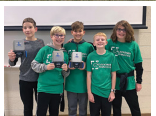
Robotics: VEX IQ Robotics, two state qualifiers!