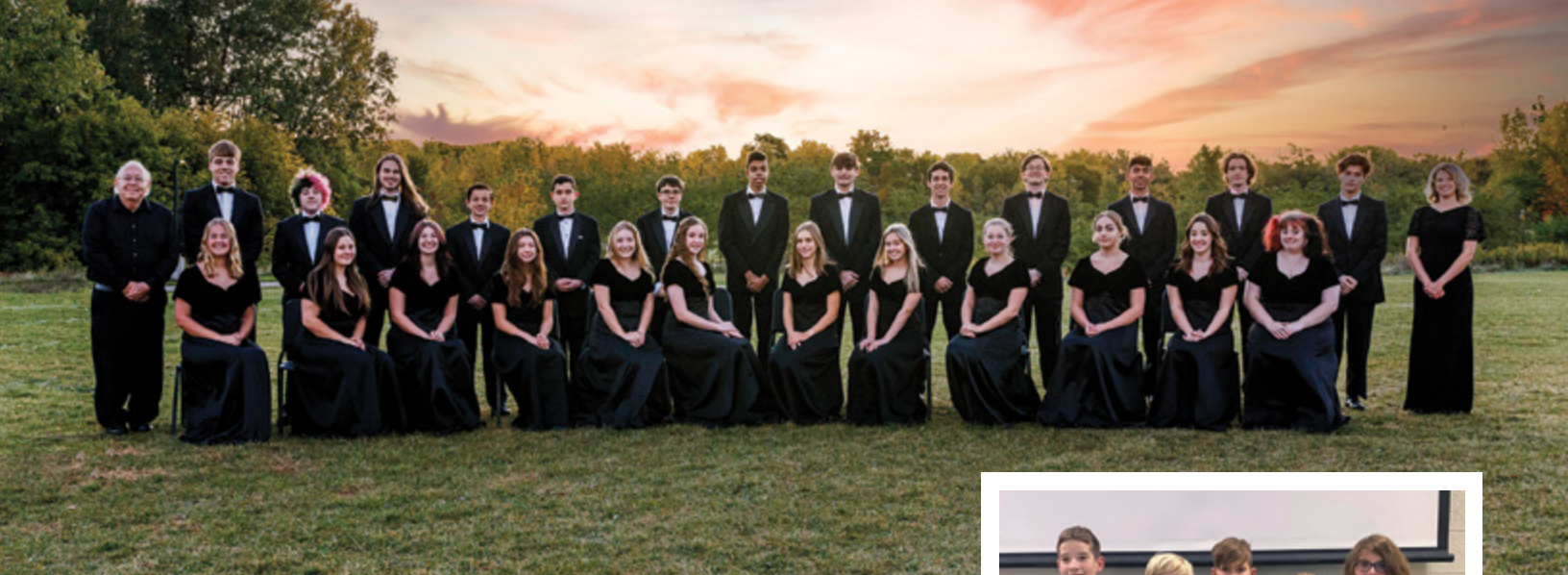
Choralaires: Michigan Music Conference finalist!