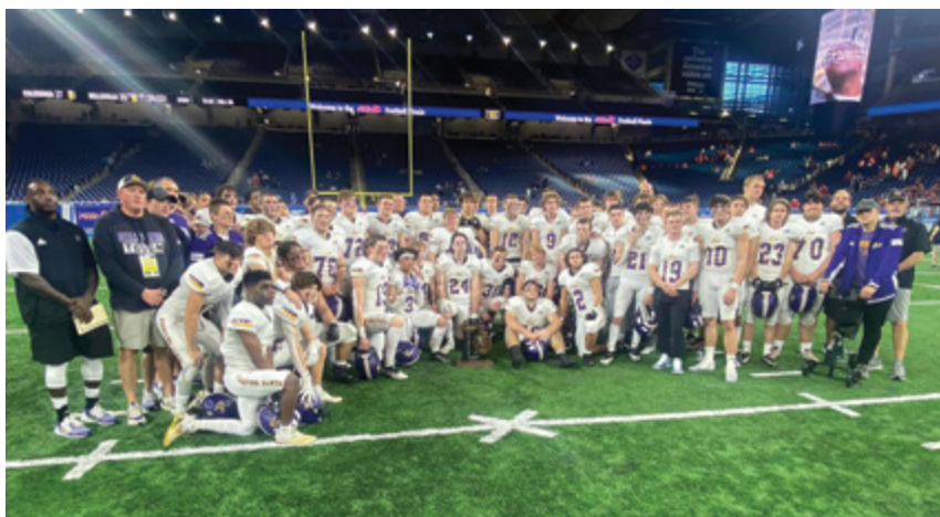
Football: State finalists!