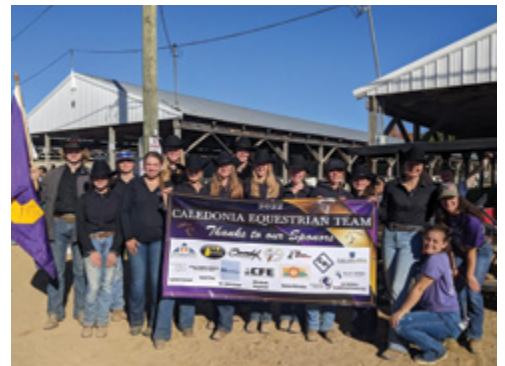
Equestrian: Three-time state champions!