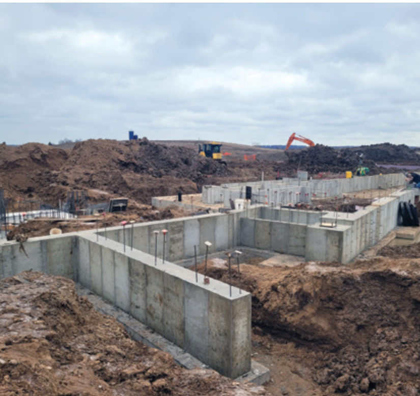
Construction of the Cal Community Center continues.

We appreciate the opportunity to serve our community through these important projects and look forward to the improvements all around the school district, helping ensure our facilities and programs are ready to meet the needs and challenges of our students, staff and community.